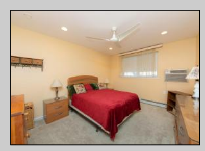
9300 Atlantic Ave Margate, NJ 08402