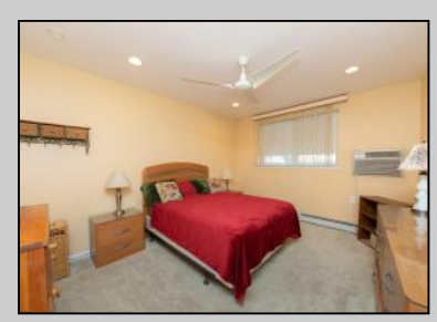
9300 Atlantic Ave Margate, NJ 08402