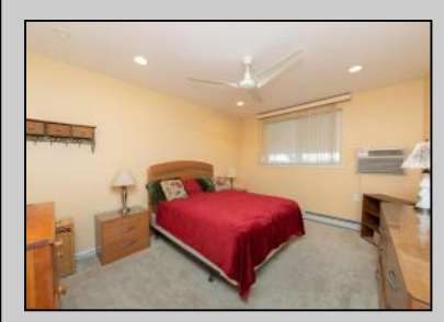
9300 Atlantic Ave Margate, NJ 08402