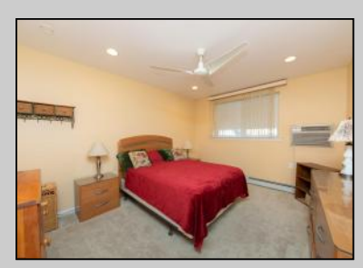
9300 Atlantic Ave Margate, NJ 08402