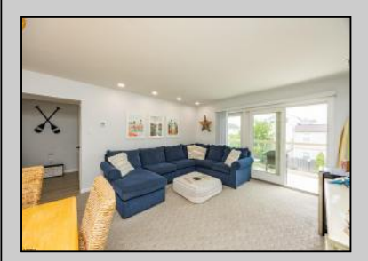
5 New Haven Ventnor, NJ 08406