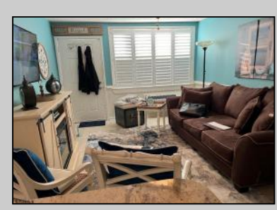
9510 Amherst Margate, NJ 08402