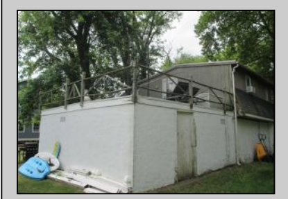
693 Town Bank Rd Cape May, NJ 08204