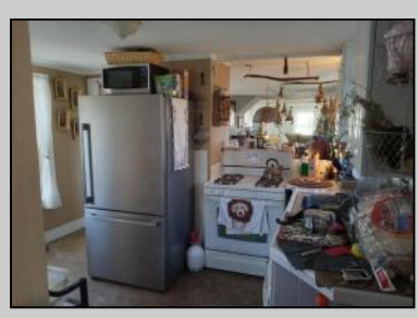
12 Pennington Mays Landing, NJ 08330