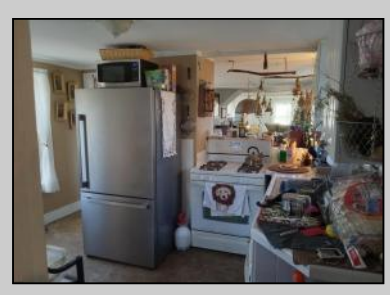
12 Pennington Mays Landing, NJ 08330