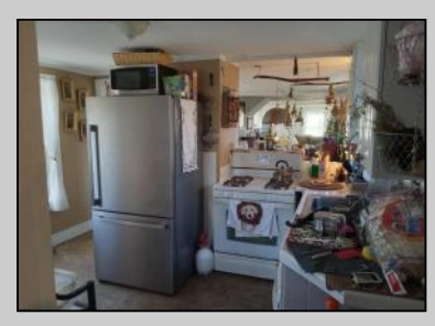
12 Pennington Mays Landing, NJ 08330