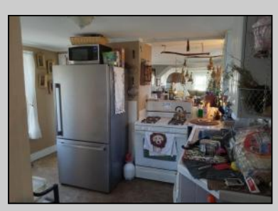
12 Pennington Mays Landing, NJ 08330