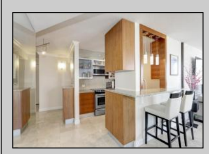
526 Pacific Atlantic City, NJ 08401