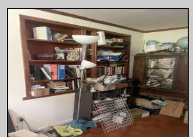
221 Sylvan Ave Galloway Township, NJ 08205