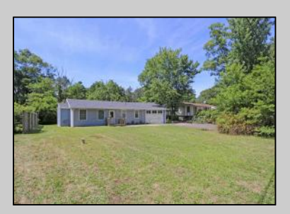
415 10th Newtonville, NJ 08436