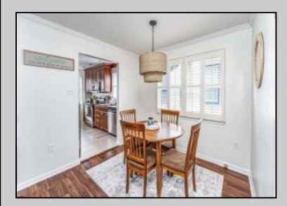
345 Asbury Ocean City, NJ 08226