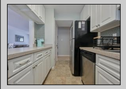
138 Flinders Reef Ocean City, NJ 08226