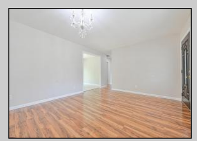
29 Evergreen Ave Egg Harbor Township, NJ 08234