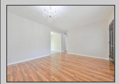
29 Evergreen Ave Egg Harbor Township, NJ 08234