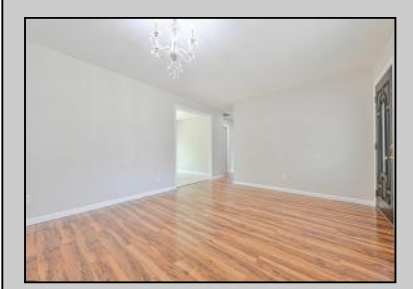
29 Evergreen Ave Egg Harbor Township, NJ 08234