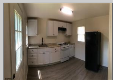
709 Spruce Pleasantville, NJ 08232