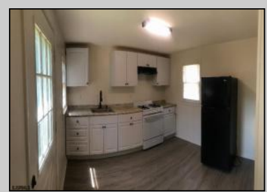
709 Spruce Pleasantville, NJ 08232