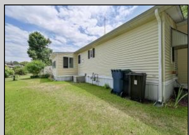
167 Country Buena Vista Township, NJ 08310