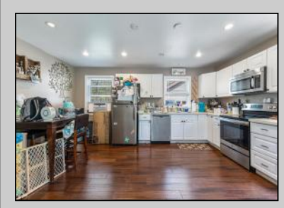
86 Sunny Ln Cape May Court House, NJ 08210