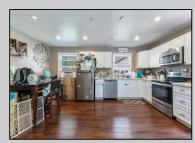
86 Sunny Ln Cape May Court House, NJ 08210