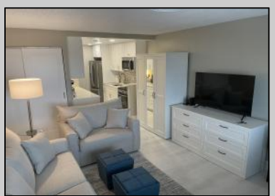
111 Surrey Ventnor, NJ 08406