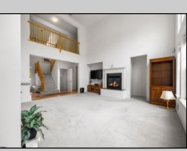
150 Crystal Lake Egg Harbor Township, NJ 08234