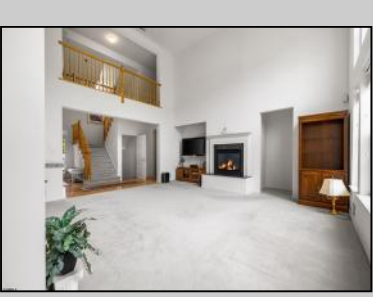
150 Crystal Lake Egg Harbor Township, NJ 08234