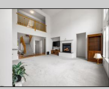
150 Crystal Lake Egg Harbor Township, NJ 08234