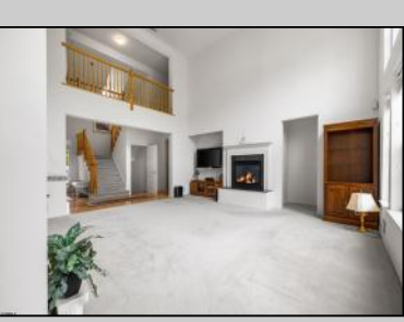
150 Crystal Lake Egg Harbor Township, NJ 08234