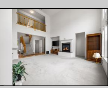
150 Crystal Lake Egg Harbor Township, NJ 08234