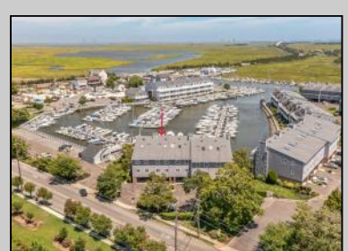
104 Harbour Cove Somers Point, NJ 08244