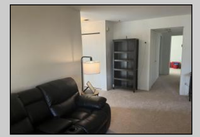
2616 Primrose Ct Mays Landing, NJ 08330