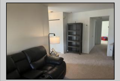
2616 Primrose Ct Mays Landing, NJ 08330