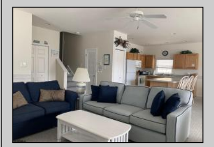
5560 West Ave Ocean City, NJ 08226