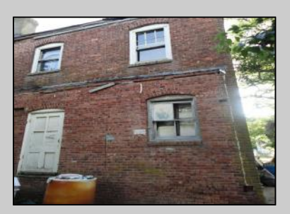
120 2nd Pleasantville, NJ 08232