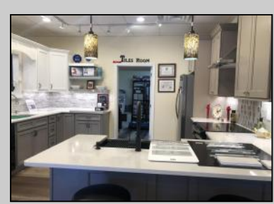
6636 Black Horse Pike Egg Harbor Township, NJ 08234