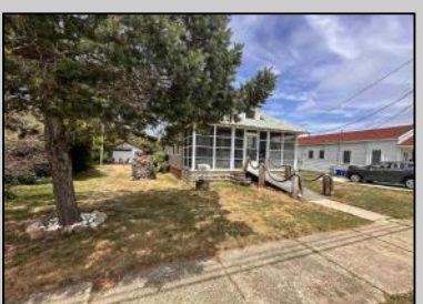
715 1st Somers Point, NJ 08244