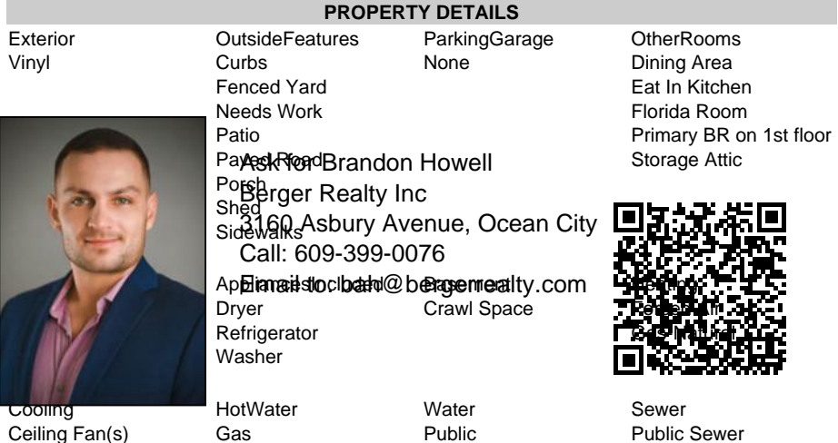
Ceiling Fan(s) Central Gas

Nestled in a serene neighborhood on Gulph Mill Road, this charming Somers Point rancher offers both tranquility and convenience. Located near the Great Bay Golf Course and just a short drive or bike ride to Ocean City and Linwood, this home boasts delightful curb appeal with offstreet parking and a cozy covered front porch. The tiled entryway welcomes you into a spacious living room featuring a beautiful bay window. Open to the converted garage, this room now serves as a versatile family room with a gas fireplace, perfect for relaxing or working from home. The eat-in kitchen, equipped with a center island, ample counter and cabinet space, and sliding glass doors, opens to a lovely sunroom. Adjacent to the kitchen, you/ill find a large laundry room with a newer washer and dryer. The three generously sized bedrooms offer plenty of closet space, with the master bedroom featuring its own full bathroom. An additional full bathroom serves the other bedrooms. The private rear yard includes a large shed and patio area, ideal for outdoor enjoyment, with the soothing white noise of the nearby parkway providing a peaceful backdrop. Savvy 2nd home buyers will love this one as their ideal summer home!!! seller selling in its current \"as is\" condition.