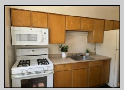
3501 Ventnor #A-2 Atlantic City, NJ 08401