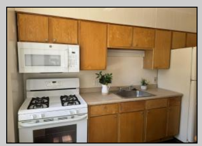
3501 Ventnor #A-2 Atlantic City, NJ 08401