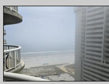
3101 Boardwalk Atlantic City, NJ 08401