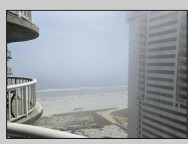
3101 Boardwalk Atlantic City, NJ 08401