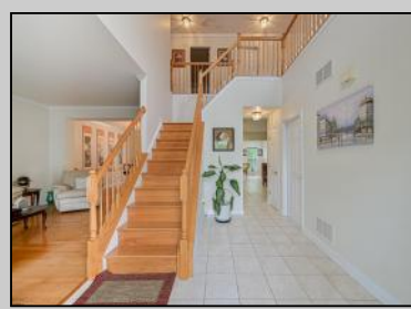
424 Coventry Galloway Township, NJ 08205