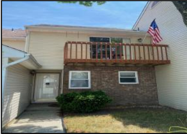
92 Woodland Absecon, NJ 08201