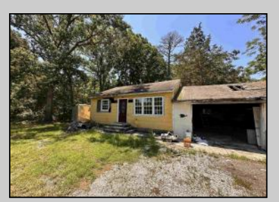
86 Route 50 Ocean View, NJ 08230