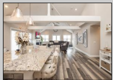
1000 Asbury Ocean City, NJ 08226