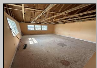
33 Route 9 South Marmora, NJ 08223