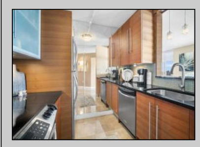
526 PACIFIC Atlantic City, NJ 08401