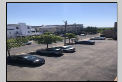
330 42nd Street Brigantine, NJ 08203