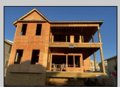
2709-11 West Ocean City, NJ 08226